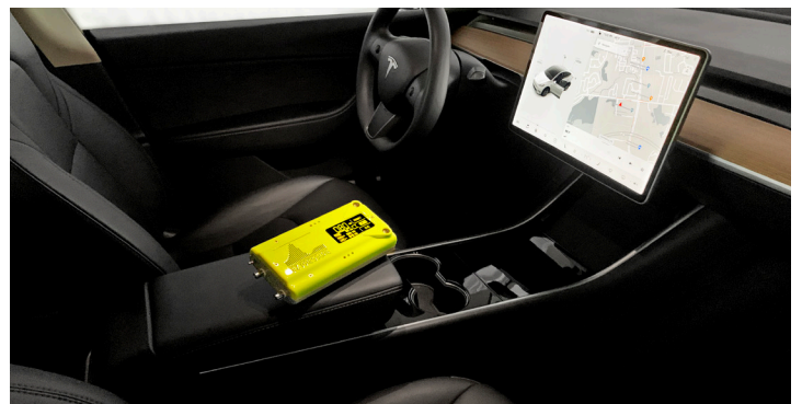
EZPressure placed inside cabin.

EZPressure is a fast response pressure sensor focused on characterizing the dynamic pressure change during the extraction of the air trapped in the cabin. The cabin pressure change can be observed during a door closing event. This is a different situation than a flow/leak testing, that recreates a steady state condition. The cabin pressure will generate a damping of the door and by absorbing the energy, changing the vibrations and sounds that can be excited from an impact. By using EZPressure, the seal characteristics can be investigated by measuring cabin pressure changes.