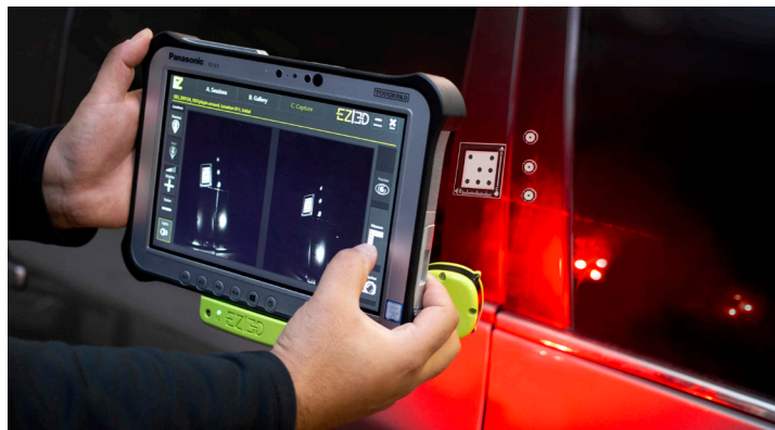
EZ3D Targets placed on exterior car door.

EZ3D is a 3D measurement system to quickly and in a very easy way to determine the current flushness or change in flush and gap. This can be a measurement to document the adjustment of the door during sound testing; for example, moving the door up/down or in/out and evaluate the sound signature in function of the different settings. The same measurements can be used to document semi static door deflection due to pressure load. For example, wind tunnel setup to quantify the outbound deflection of the door window frame area. These measurements can be taken from the inside as it consists of taking simple pictures of optical targets attached to door and body and upon the immediate processing in near real time, the 3D displacement is reported.