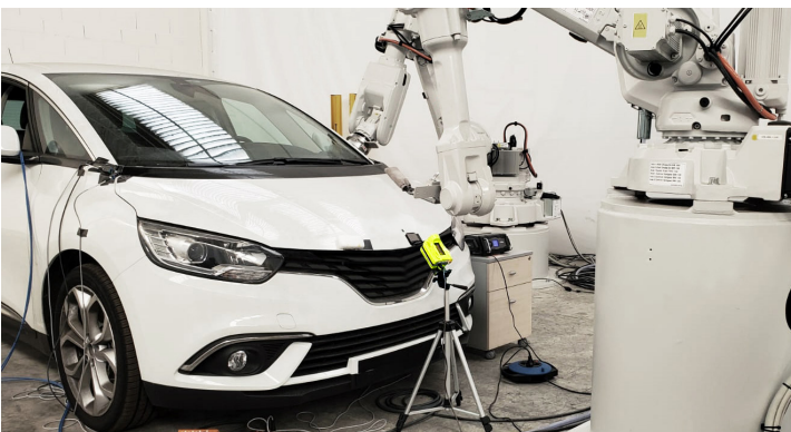
EZSpeedBox set up on tripod.