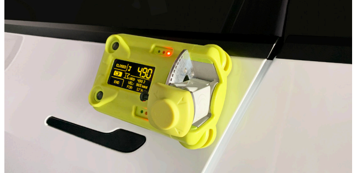
Wireless EZEnergy set up on EV car.

EZEnergy is our next level device in door analysis and can record the full speed profile of the door. EZEnergy combined with Audit software could provide the continuous speed in function of the door angle. This allows to establish a correlation of the position, speed and other data. For NVH Applications, it would be important to record sound characteristics of the door for specific door angles. Speed-angle graphs would provide a comprehensive analysis of the door speed behavior.