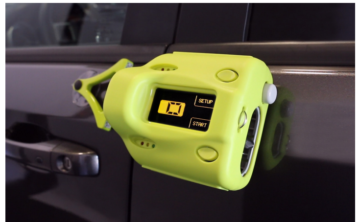
EZSpeed placed on a car.

EZSpeed can be used to record an instantaneous speed of the door. This is essential metric to include in the door sound measurements. EZSpeed will be able to document the impact speed of the door for every single test. To eliminate the device sound on the door, it can be mounted on a separate tripod, and therefore have no influence on the sound signature. The target, that is used in production environment to increase mounting tolerances, is not required as the system can be easily monitored in audit environment. The speed, that is shown on the large screen, can be manually recorded, and documented with our Audit Software. This technology is applicable to any door style (pivoting, sliding, liftgate, hood, trunk, frunk, etc.).