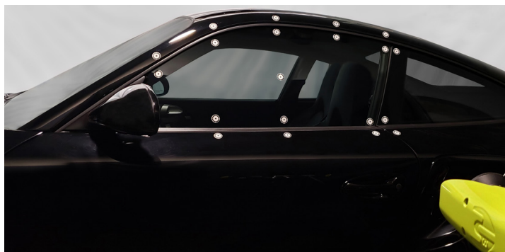
3D kinematic scan produced from EZMatix.